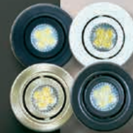
STANDARD 3" LED LIGHTS