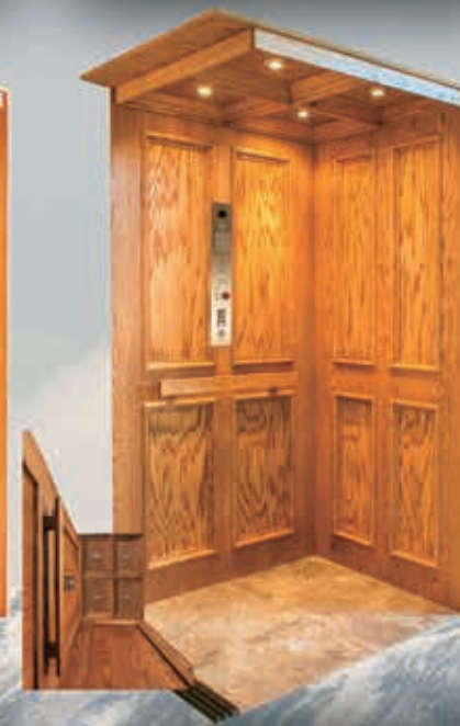
RED OAK AMERICAN***

*STANDARD TWO LIGHT SHOWN **SINGLE TRAY TWO LIGHT OPTION ***FOUR TRAY FOUR LIGHT OPTION