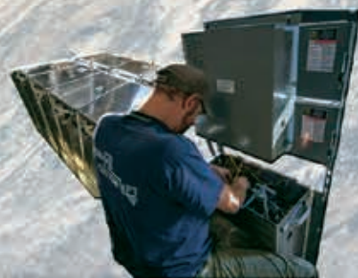
THE POWER UNITS BEING ASSEMBLED.