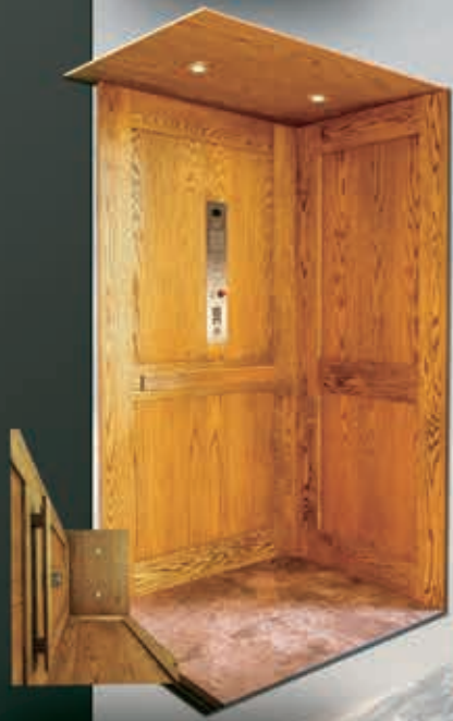
RED OAK CLEAR*