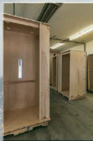
EVERY CAB IS HAND BUILT AND TEST ASSEMBLED FOR FIT AND FINISH BEFORE SHIPPING.