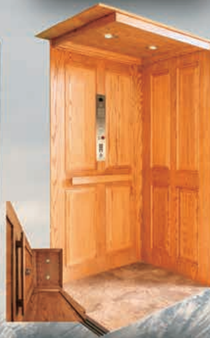
WHITE OAK GOLDEN**