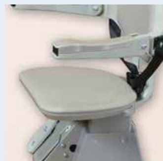
Power swivel seat for effortless exit. Armrest switch control or wireless call/send.